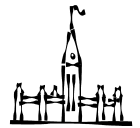
Hotel Royal Palm