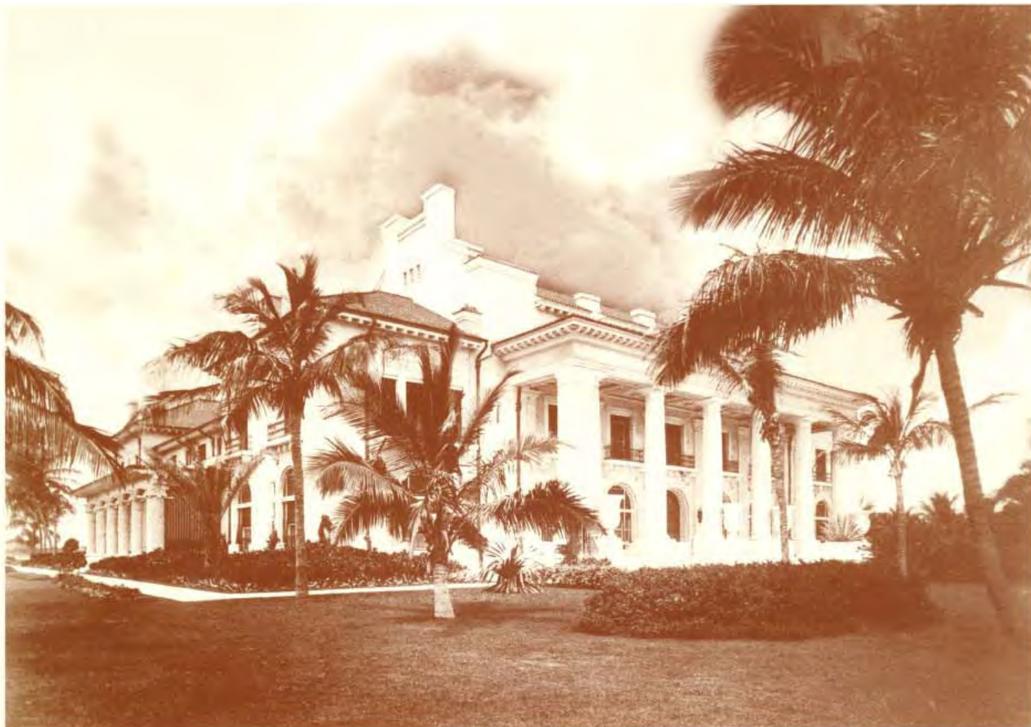
WHITEHALL, HENRY FLAGLER'S ESTATE COMPLETED IN 1902